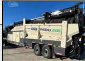
2023 Terex Ecotec Phoenix 2100

S/N: TRX00176ECMP41531, 2 Hrs., CAT C4.4 Tier 4 Final (173HP), 134 Gal. Fuel Tank, 157 Gal. Hydraulic Tank, 21'2" long by 6'4" Dia. Drum, Friction Four Wheel Drum Drive System, Variable Speed Control