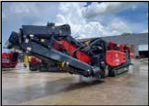
2023 Finlay I-120RS Crusher Aggregate

S/N: TRX120RSTOMP51890, 840 Hrs, Scania DC9 (350HP), Terext CR038 Impact Chamber, Fully Hydraulically Assisted Apron, Setting and Hydraulic Apron Release Manual Raise Inlet Flap