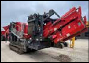
2023 Finlay 883 Screen Aggregate

S/N: TRX883M4TDGPA3345, 965 Hrs, Deutz TCD 3.6L Tier 4F (123HP), Feeder: Abrasion Resistant Plate Steel Pan Apron Feeder, Heavy Duty Chain Drive Fixed Hopper, Remote Start Stop of Pan Feeder