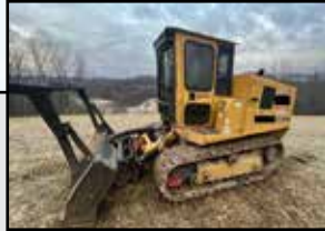
2021 Rayco C200R Track Mulcher

S/N: CR200R0100, 783 Hrs., Isuzu Engine (188HP), 66 GPM Hydraulic Flow to the Mulcher, HD Rubber Track Undercarriage, 2-Speed Ground Travel, Hydraulic Rear Winch