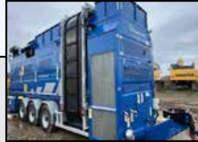
2024 Eggersmann Star Select S60 Scrap Processing / Demolition