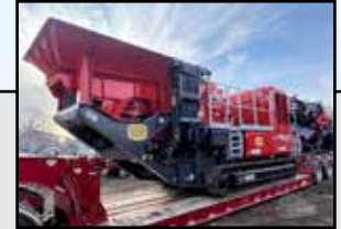
2025 Finlay I-100RS Crusher Aggregate

1,101 Hrs., CAT C7.1 (275HP), Terex CR004 Impact Chamber, Full Hydraulic Apron Setting, 4 Bar Rotor - 2 Bars High & 2 Low, Direct Drive Via Clutch, Fixed Hopper W/Vibrating Feeder