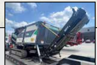
2025 Terex Ecotec TDS815 Scrap Processing / Demolition

S/N: TRXE017KCMS48469, 16 Hrs., Dual Shaft - Slow Speed, Green Waste Shafts, Concrete Shafts, Small Demo Volume Reduction