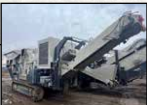
2023 KPI-JCI GT4400C Crusher Aggregate

S/N: 420387, 701 Hrs., Cummins QSL9 Tier IV 1,800 RPM (380HP), Radio Remote And Tether, 4240 Horizontal Shaft w/HD Solid Rotor, Variable Speed Hyd. Crusher Drive