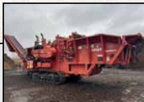
2012 Morbark 3800XL Horizontal Grinders