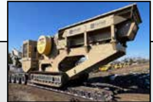
2019 KPI-JCI FT2650 Crusher Aggregate

S/N: 418595, 1,908 Hrs., CAT C9.3, Tier IV 1,800 RPM (300HP), Radio Remote and Tether, 2650 Pioneer Jaw Crusher, Hyd. Dual Wedge Adjust CSS, Hyd. Drive For Crusher