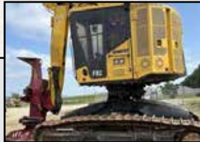
2019 Komatsu XT465L-5 Track Feller Bunchers

S/N: A900914, 4,596 Hrs., Full Service, Work Ready, Quadco 27B