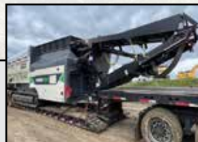
2025 Terex Ecotec Phoenix 2100T Screen Aggregate

S/N: TRX2100THCMR14035, 7 Hrs., CAT C4.4 Tier 4 Final (173HP), 11.11 Cubic Yard Hopper, Rear/Side Extension, 47" Feed Conveyor, 3 Ply, Variable Speed Control, 47.2" Collection Conveyor, 3 Ply