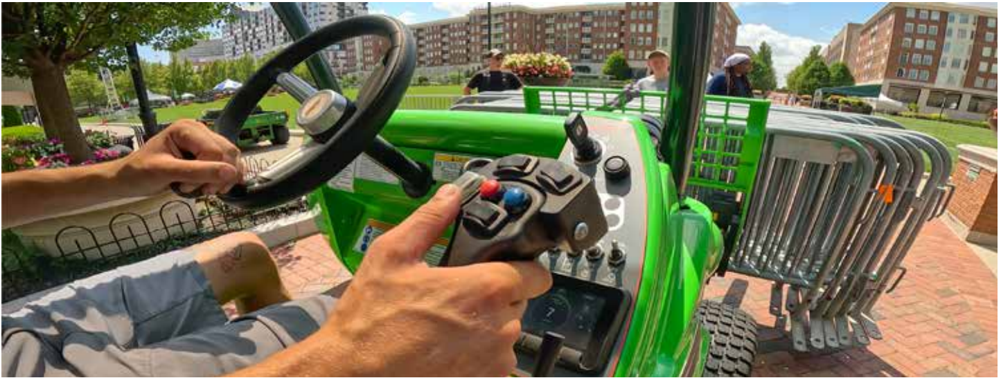
An array of over 200 attachments makes Avant one of the most versatile solutions on the market.

loader with an offset telescopic boom. With about 200 attachments available, owners can infinitely customize the Avant to their specific needs.