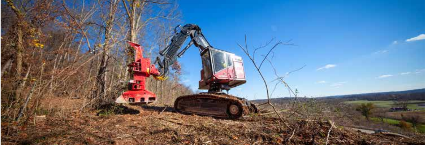
In addition to the machine's strong performance, Complete Clearing's Brock Dixon considers the 735D's cab environment "the best out there."

does clearing for large-scale subdivisions.