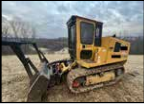
2021 Rayco C200R Track Mulcher

S/N: CR200R0100, 783 Hrs., Isuzu Engine (188HP), 66 GPM Hydraulic Flow to the Mulcher, HD Rubber Track Undercarriage, 2-Speed Ground Travel, Hydraulic Rear Winch