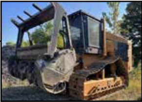
2019 CMI C475 Track Mulcher

S/N: CA400302, 1,972 Hrs., CAT Tier 4F C-13 (475HP), 4 Pump Hydraulic System, Attachment One Piston Pump, Track Two Piston Pumps, Auxiliary Function One Gear Pump