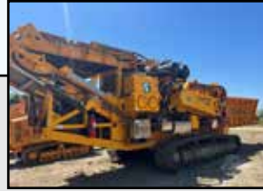
2023 CBI Magnum Force 6800CT Horiz. Grinder

S/N: O11282, 898 Hrs., CAT C27 Tier 4F Diesel Engine (1,050HP), PT Tech HPT015 Hyd. Clutch, Auto Reversing Fan System, 40" x 60" Hammermill (24 Hammer Pattern), Forged Drum Offset Helix Rotor