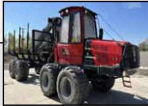
2016 Komatsu 865 Forwarder

S/N: 1657, 895 Hrs., Komatsu 865 Forwarder Base, Crane, CRF 11, 25'7" Loading Reach, Grapple, Komatsu G36 HD Grapple, 8 Wheel Arrangement, Bogie Front Axle, Bogie Axle Rear Frame