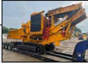
2023 CBI Magnum Force 5800BT Horiz. Grinder

S/N: O22100, 1,972 Hrs., CAT C18 Tier 4F Diesel Engine (765HP), Auto Reversing Fan System, 48" Wide x 40" Diameter Hammermill, Forged Drum Offset Helix Rotor, 6" Rotor Shaft