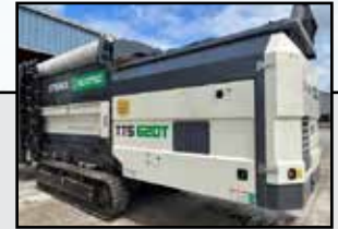
2022 Terex Ecotec TTS620T Screen Aggregate