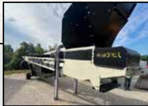
2024 MGL 842XR Conveyor/Feeder/Stacker

S/N: 842XR163, 16 Hrs., Cummins 74HP, Fixed Brake Tandem Road Axles, Hydraulic Fold Down Radial Wheels, Dual Drive Wheels, HD Hydraulic Transport Jack, Chevron Belt, Pivot Plate