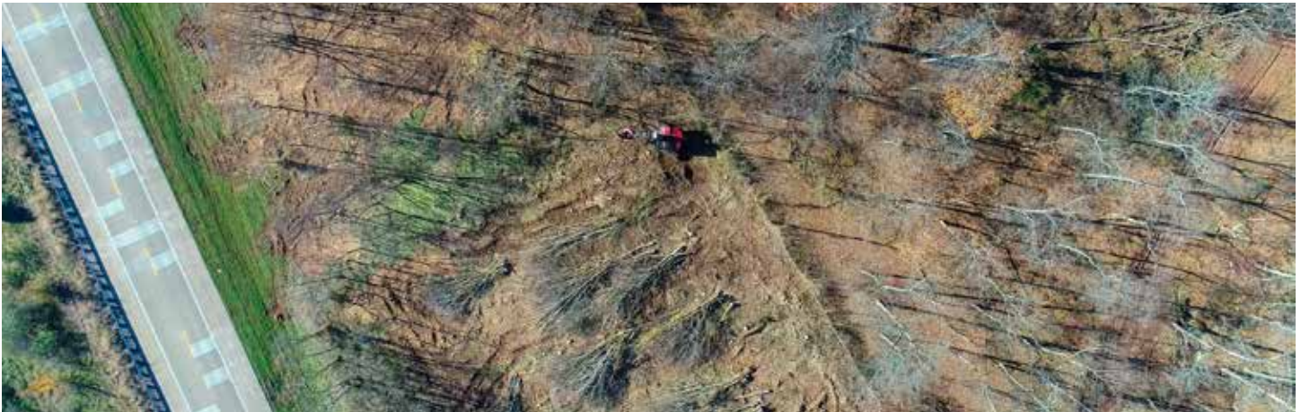
Complete Clearing's TimberPro 735D at work in Portland, Ohio. The U.S. 33 widening project covers 13 miles of the artery, is 350 to 700 feet wide, and encompasses 168 acres of clearing over 314 acres of total disturbance.

When your entire day is spent in a piece of machinery, every upgrade makes a difference. Complete Clearing Inc. recently acquired two new TimberPro 735D tracked feller bunchers to replace the aging Komatsu Forest 430 feller bunchers they've owned for about 6 years, and Operator/Foreman Brock Dixon is enjoying the creature comforts the new machines provide.