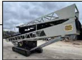
2024 MGL 842T Conveyor/Feeder/Stacker

S/N: 842T369, Cummins 74HP, Oversized Crawler Tracks, Wireless Remote, Oversize Radial Hopper, Plain Vulcanized 3 Ply Belt