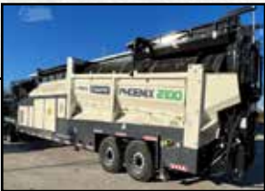
2023 Terex Ecotec Phoenix 2100

S/N: TRX00176ECMP41531, 2 Hrs., CAT C4.4 Tier 4 Final (173HP), 134 Gal. Fuel Tank, 157 Gal. Hydraulic Tank, 21'2" long by 6'4" Dia. Drum, Friction Four Wheel Drum Drive System, Variable Speed Control