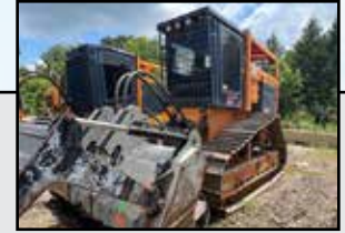
2018 CMI C450 Track Mulcher

S/N: GBC08813, 2,662 Hrs., CAT Engine, Pre Emissions, FAE 300U-250