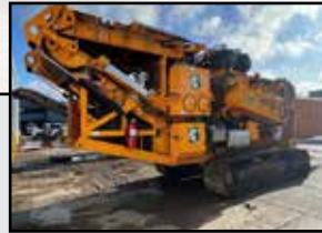
2023 CBI Magnum Force 6800CT Horiz. Grinder

S/N: O11304, 785 Hrs., CAT C27 (1,050HP), Mag Head Pulley