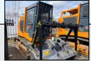
2023 CMI C175 Twister II Track Mulcher

S/N: CUD206005, 142 Hrs., Cummins C4.5 Stage V (173HP), 4 Pump Hydraulic System, 78.5 Gal Fuel Tank, 29 Gal. Hydraulic Reservoir, 22" Single Grouser Track Pads with Mud Holes