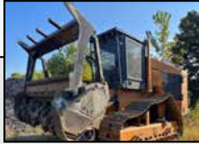
2019 CMI C475 Mulch and Mowing

S/N: CA400302, 1,972 Hrs., Caterpillar Tier 4F C-13 (475HP), 4 Pump Hydraulic System Attachment, One Piston Pump Track, Two Piston Pumps, Auxiliary Function