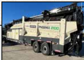
2023 Terex Ecotec 2100

S/N: TRX00176ECMP41531, 2 Hrs., Cat C4.4 Tier 4F (173HP), 134 Gal. Fuel Tank, 157 Gal. Hydraulic Tank, 21'2" Long by 6'4" Dia. Drum, Friction Four Wheel Drum Drive System, Variable Speed Control, 7.4 Cu. Yd. Capacity Hopper