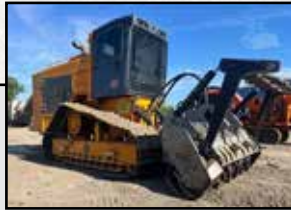
2023 CMI C500 Track Mulcher

S/N: CU503402, 974 Hrs., Cummins Tier 4F X-15 (500HP), 4 Pump Hydraulic System, Attachment One Piston Pump, Track Two Piston Pumps, Auxiliary Function One Gear Pump