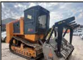
2023 CMI C400L Track Mulchers

S/N: CU302705, 337 Hrs., Cummins Tier 4F QSL9 (400HP), 4 Pump Hydraulic System Attachment, One Piston Pump Track, Two Piston Pump Auxiliary Function, One Gear Pump Dry