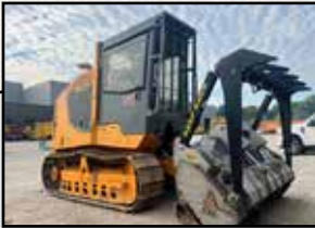
2022 CMI C175 Twister II Track Mulcher

S/N: CUD203804, 1,055 Hrs., Cummins C4.5 Stage V (173HP), 4 Pump Hydraulic System, 78.5 Gal Fuel Tank, 29 Gal. Hydraulic Reservoir, 22" Single Grouser Track Pads with Mud Holes