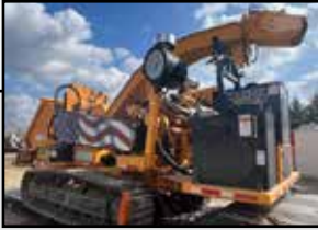
2022 Bandit 3090T Wood Chipper

S/N: 523191, 259 Hrs., Caterpillar (755HP), 37" Dia. X 36" Wide Drum with (6) Knives, 30" Dia. X 36" Wide Top Feed Wheel, 10-5/8" Dia. X 36" Wide Bottom Feed Wheel