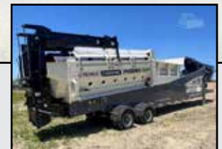
2024 Terex Ecotec Phoenix 1600

S/N: TRXP1600KCMR24889, 6 Hrs., CAT C4.4 Tier4F Diesel Engine (110HP), 5' x 16' Screen, 3.3 Cu. Yd. Hopper Capacity, Radial Conveyor w/180 Degree Swing and Variable Discharge Height