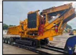
2023 CBI Magnum Force 5800BT Horizontal Grinder

S/N: 022100, 108 Hrs., Caterpillar C18 Tier 4F Diesel Engine (765HP), Auto Reversing Fan System, 48" Wide X 40" Dia. Hammermill, Forged Drum Offset Helix Rotor, 6" Rotor Shaft