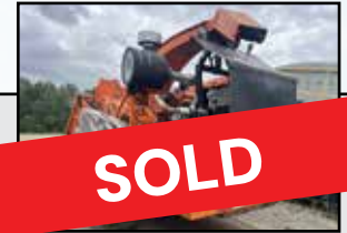
2022 Bandit 3090T Self-Propelled Wood Chipper

S/N: 518900, 546 Hrs., 37" Dia. x 36" Wide Drum with (6) Knives, 30" Dia. x 36" Wide Top Feed Wheel, Standard 7-1/2" Infeed Conveyor, Air Compressor, Double Grouser Tack Pads