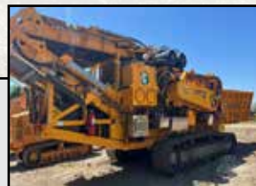
2023 CBI Magnum Force 6800CT Horizontal Grinder

S/N: 011282, 322 Hrs., Caterpillar C27 Tier 4F Diesel Engine (1050HP), PT Tech HPT015 Hyd. Clutch, Auto Reversing Fan System, 40" X 60" Hammermill (24 Hammer Pattern)