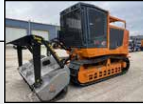
2023 CMI C300

S/N: CUD610010, 309 Hrs., 6.7 Liter Cummins Engine, PO 43991, 22" Track Pads, D4 Undercarriage Winch, FAE Mulcher Attachment