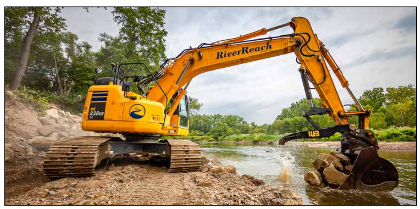
The Cuyahoga Valley National Park Riverbank Stabilization design-build project calls for over 75,000 tons of material to be placed at eight different sites along the river. The $12 million project will take an estimated 2.5 years to complete and will address erosion risk to not only the park but to the neighboring scenic railway and towpaths too.

Additionally, because operators know they have the grade right when setting stones, the need for rework has been reduced. "All that adds up to increased profits," he said.