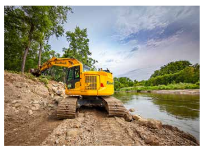
RiverReach Construction has relied upon Komatsu equipment for over two decades. The performance and technological advancements of the brand are proving a major benefit at the National Park Service's Cuyahoga Valley National Park Riverbank Stabilization project.

RiverReach, a longtime Columbus Equipment Company customer, runs four Komatsu excavators with aftermarket Topcon GPS systems installed by Columbus Equipment's SmartConstruction Division. The company's PC238 is equipped with a Topcon MC-MAX, which provides a high level of automation during all phases of grading for maximum productivity. The contractor's PC138, PC228 and PC290 longreach are all equipped with Topcon X-53i systems, and the company also has three Topcon HiPer VR base stations and rovers. RiverReach also owns a Komatsu D61i dozer with fully integrated automatics.