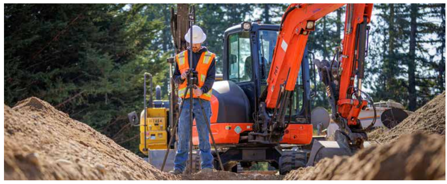
No matter how demanding the specification, every job needs to get to grade. CEC Smart Positioning will get you there with smooth, accurate results.

Columbus Equipment Company is now an authorized Komatsu OEM Topcon Positioning Systems dealer throughout the state of Ohio, offering sales, installation, service and support for Topcon machine control and general construction positioning solutions.