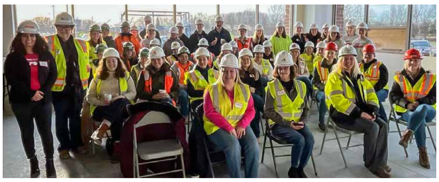
Columbus' NAWIC #86 Chapter on a site visit to Dublin Jerome High School. General Contractor Elford Inc. hosted the visit to the $28 million project.

Other events during the week included a panel discussion and networking event, where Columbus Equipment Company was a sponsor.