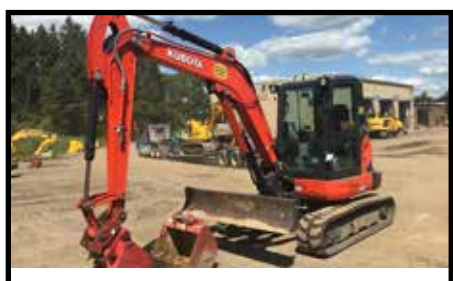
2017 Kubota KX057-4 Stock# R32649, Cab, A/C, Blade, Cplr, Bucket, 684 Hrs.