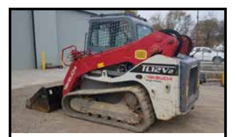
2015 Takeuchi TL12V2 Stock# 32240T, Cab, A/C, Bucket, 843 Hrs.

For a Complete List of Used Equipment, Please Visit www.columbusequipment.com