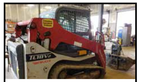
2016 Takeuchi TL10V2-CR Stock# R36366T, Cab, A/C, Heat, Tooth Bucket, Coupler, 1,690 Hrs