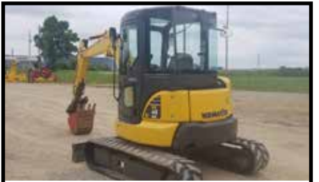
2015 Komatsu PC45MR-3 Stock# K10232T, Cab, A/C, Blade, Coupler, Bucket, 3,052 Hrs.