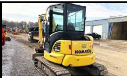
2018 Komatsu PC55MR-5 Stock# RDK10161, Cab, A/C, Blade, Cplr, Bucket, 2,049 Hrs.