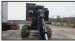
2009 Timbco 445 EXL Feller Buncher SN: 92505, approx. 12,000 hrs., Tracked Feller Buncher w/22B Hot Saw