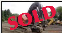
2014 Barko 240 Feller Buncher Excellent Condition, Cummins Warranty thru 10/18, Hotsaw Plumbed/Rated up to 20", approx. 1,480 hrs.