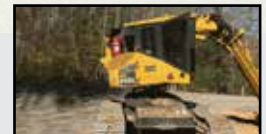
2015 Komatsu XT 445L Feller Buncher w/Quadco 22SC, 3,800 hrs.