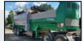
2014 Komtech Cribus 2800 SN: 27018, approx. 605 hrs., Wheeled Trommel with Multiple Drums