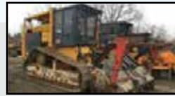
2009 CMI C400 Mulcher John Deer 12L, 450HP, 12V Electrical System, D5-H Type Undercarriage w/ Elevated Final Drive, Over $100,000 refurb.