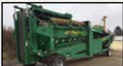
2014 McCloskey 516RE Trommel 625 hrs.