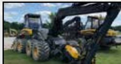
2012 Ponsse Ergo Harvesters and Processors