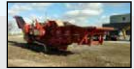
2017 Morbark 4600XL Track Wood Hog Tier II C27, 1,050 HP