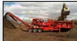
2012 Morbark 3800XL SN: 191-1027, approx. 3,675 hrs., 800 HP CAT, Rubber Tire Grinder