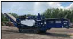
2016 Peterson Pacific 4710B Mobile Wood Grinder