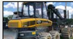
2012 Ponsse Buffalo Logging Attachments