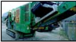
McCloskey J45 Jaw Crusher Approx. 500 hrs., Volvo D11 Tier 4F, 360 HP, Overband Magnet, Manual Variable Speed, Hopper Extension, Longer Pan Feeder, Wireless Remote Control, Dust Covers-Spray Bars