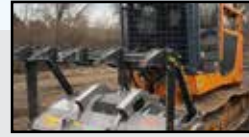
2018 CMI C250 Mulcher SN: GBJ33223, FAE 300U-210 MULching Head, 163 hrs.