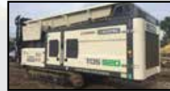
2017 Terex TDS 820 Shredder Scania 440 HP HAAS 2000XL Twin Shaft, 9/9-4 Configuration