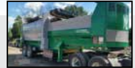
2014 Komptech Cribus 2800 SN: 27018, approx. 605 hrs., Wheeled Trommel with Multiple Drums