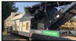
2018 Terex PH2100 Screening System Cat C4.4 Teir 4 Final (173 HP), 60, 500 LBS. 6'4" x 21'2" Drum