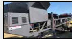
2018 McCloskey 36x80 Material Mover Cat Tier 4 Final C2.2 (49 HP), Hyd Axle Jacks Hyd Landing Gear, Hopper, Wing Plates, Martin Scraper, Road Towable, 3 Ply Plain Belt Standard Feedboot