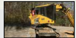
2015 Komatsu XT 445L Feller Buncher w/Quadco 22SC, 3,800 hrs.