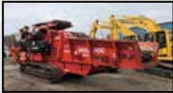
2017 Morbark 3400XT Wood Hog SN: 194-1025, 765 HP Tier II, CAT C18 Strickland Undercarriage, 557 hrs.