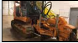
2018 CMI C250 Mulcher SN: GBJ31621, CMI S250HD Head, 315 hrs.