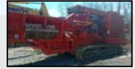
2016 Morbark 3800XL Cat C18 Tier II (765 HP), PT Tech HPT014FX Hyd Clutch, 32" x 60-3/8" Hamermill Magnetized End Pulley, Hyd Rod Puller