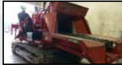
2015 Morbark 30/36 NCL Track Mobile Wood Chipper 36" Diameter Advantage 3 Drum (6) Knife 320L, Cat Undercarriage, Cat C18 Tier IV Final (600 HP)