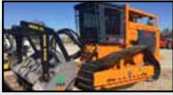
2018 CMI C450 Mulcher SN: GBJ10115, FAE Mulching Head, 3 Hrs.